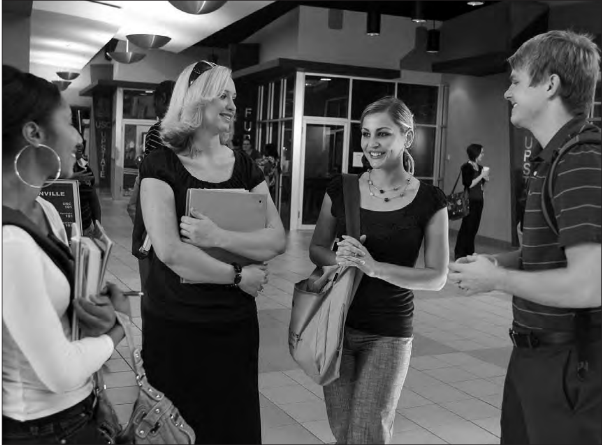
USC Upstate Greenville Campus