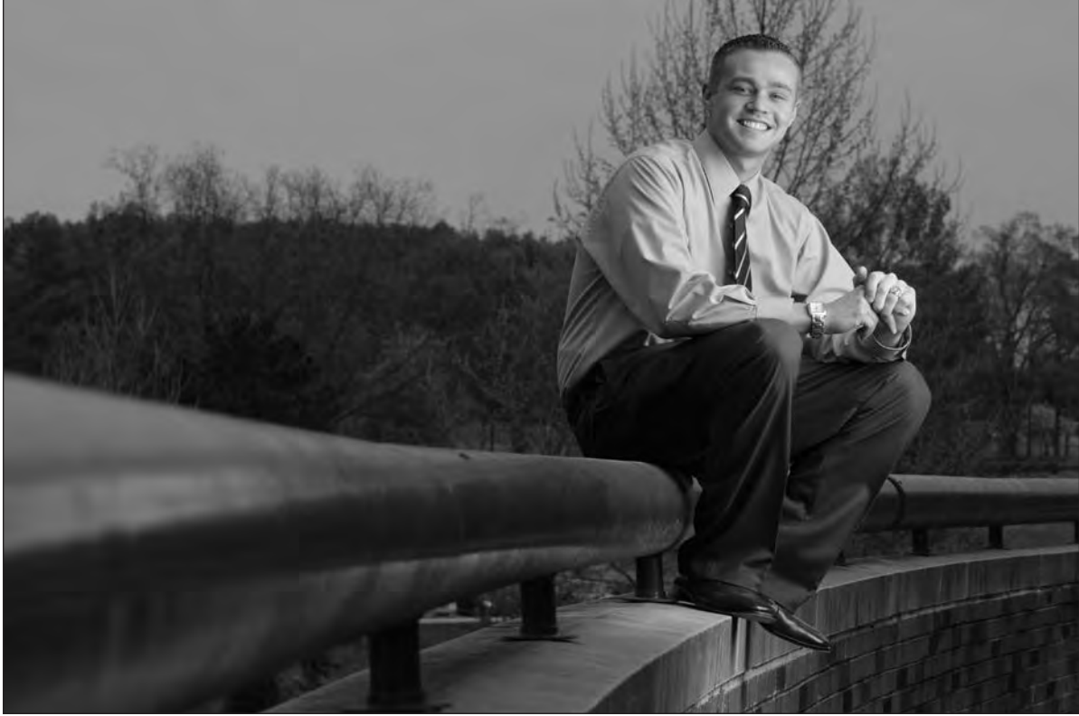
George Dean Johnson, Jr. College of Business & Economics