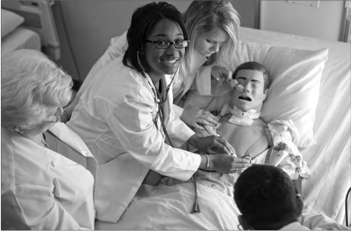
Mary Black School of Nursing